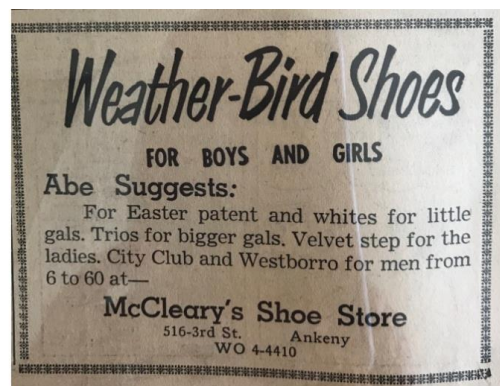
Easter ad for McCleary's Shoes, Ankeny Times, April 7, 1960