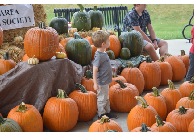
Trunk or Treats